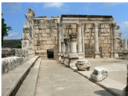
The synagogue at Capernaum. Although the present structure is later, it is almost certainly on the site of the first-century synagogue.

Therefore just as one man’s trespass led to condemnation for all, so one man’s act of righteousness leads to justification and life for all. For just as by the one man’s disobedience the many were made sinners, so by the one man’s obedience the many will be made righteous. But law came in, with the result that the trespass multiplied; but where sin increased, grace abounded all the more, so that, just as sin exercised dominion in death, so grace might also exercise dominion through justification leading to eternal life through Jesus Christ our Lord. (Romans 5:18-21)